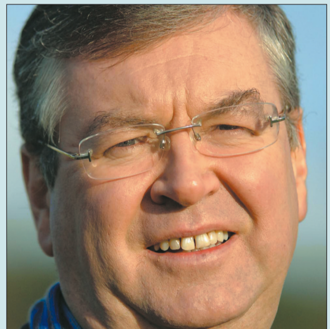
■ FAMILIAR VOICES: Clockwise from top left, RTE Radio 1 presenters Marian Finucane, Pat Kenny, Joe Duffy and Ryan Tubridy

RTE Radio 1 is home to some of Ireland's most high-profile and best-paid presenters.